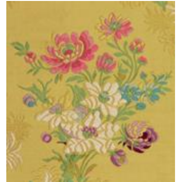
Annabell (1907) Hand-woven silk tissue

Annabell (right) and Cecilia , both sumptuous hand-woven silk tissue from the early 1900s reflect the skills of Warner & Sons' hand weavers, and remind us why the Company enjoyed such success and recognition in this field during the 19 th and 20 th centuries. The strength of floral designs in the Archive's Collection is further celebrated by Daventry , Christina and Vintage Roses . Each is uniquely detailed and charming, while demonstrating how Warner & Sons' design team successfully responded to its clients' changing tastes over the years.