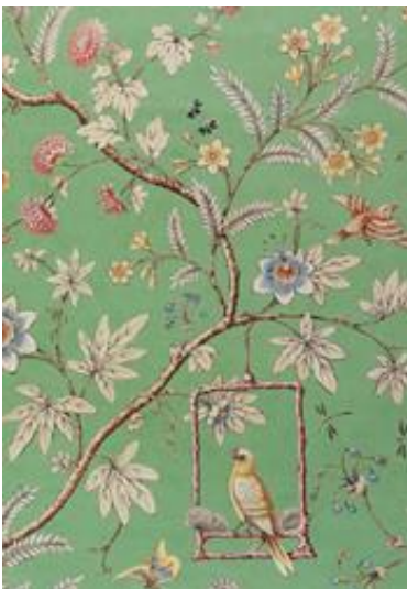
Sommerton (1930s) Hand-painted watercolour on paper

Sommerton (below) and Buckingham Toile complete the Spring range, offering captivating and elegant interpretations of strong and traditional natural motifs. With their classical and mythical connotations, birds were frequently in demand among Warner & Sons' clients. These natural themes have enjoyed appeal spanning centuries, and remain as popular with today's commercial audience as with the upper classes of the 1700s.