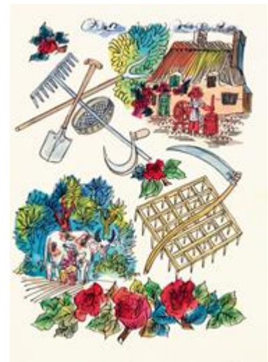
Homestead (1939) Hand-painted paper design

demand for scenic designs throughout the 19 th and 20 th centuries, and respond to a current interest in scenes and architectural structures.