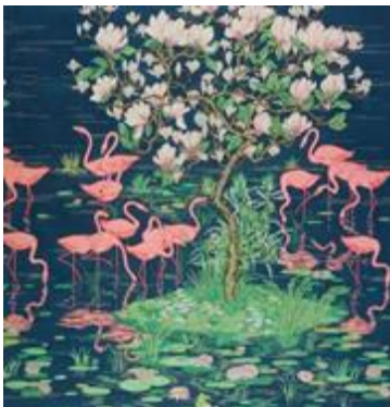
Flamingoes (1979) Hand-painted paper design

From the 1800s, the Warner & Sons name became synonymous with innovative design of the highest quality. The Company's designers made regular trips overseas, collecting documents (such as Takuma ), carrying out research and drawing inspiration for their own work. Several of the designs included in the Archive's newest range of greeting cards are surely a result of this dedication to pioneering design, and intrigue in foreign styles – Orbis , Hamza's Pavillion , Rustean's Garden , Flamingoes (left).